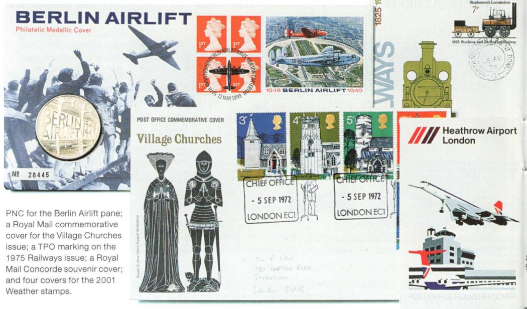
PNC for the Berlin Airlift pane; a Royal Mail commemorative cover for the Village Churches issue; a TPO marking on the 1975 Railways issue; a Royal Mail Concorde souvenir cover; and four covers for the 2001 Weather stamps.

The whole area of commemorative covers is, of course, huge, with many events being marked by a souvenir cover and a special cancellation (see above centre, Concorde's first commercial flight to Washington). Often such covers bear an appropriate stamp. Frequently these are, albeit incorrectly, referred to as 'first day covers'. From time to time Royal Mail has itself issued commemorative covers, to mark special occasions.